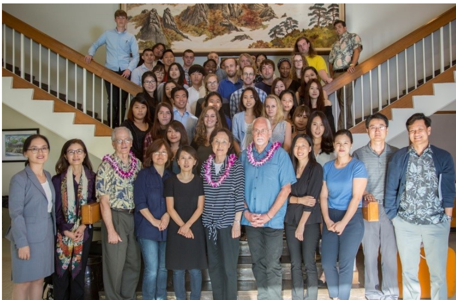
2016 Farewell Ceremony 2016년 학기말 행사 (May 6, 2016)