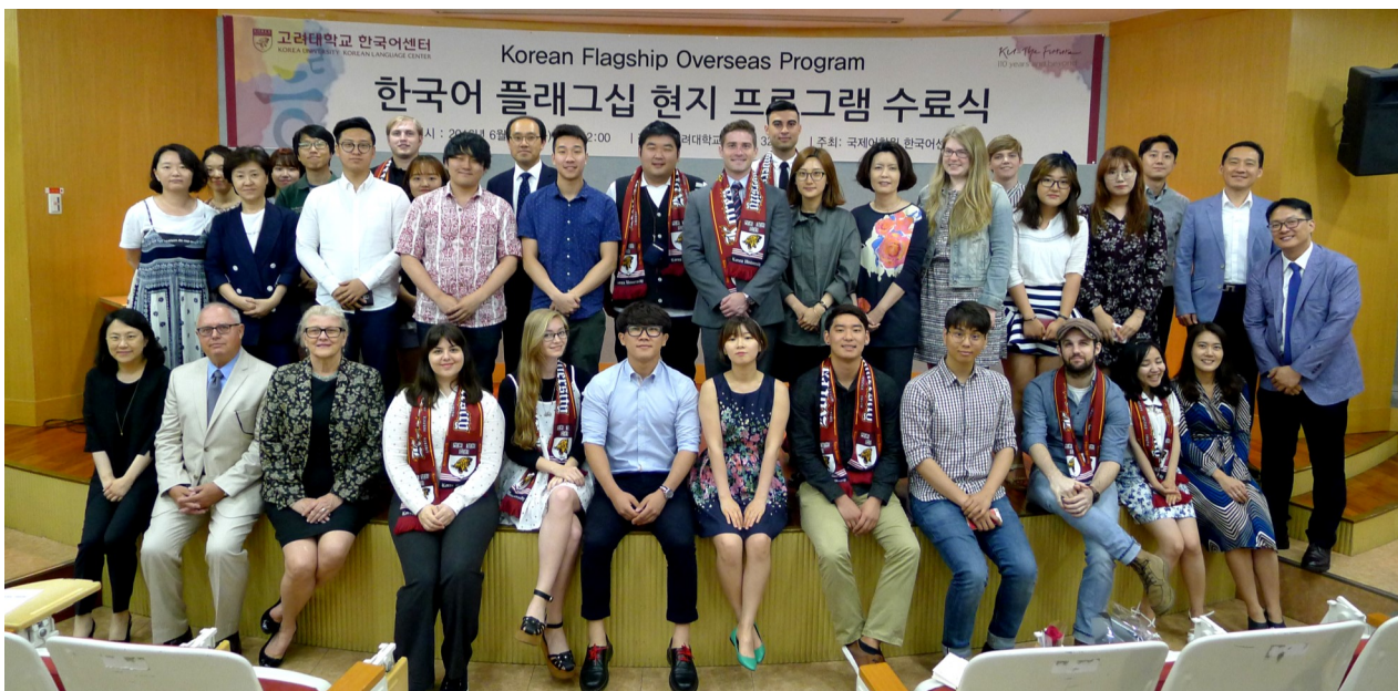
Korean Flagship Overseas Program Completion Ceremony 한국어 플래그십 현지 프로그램 수료식 (June 16, 2016)